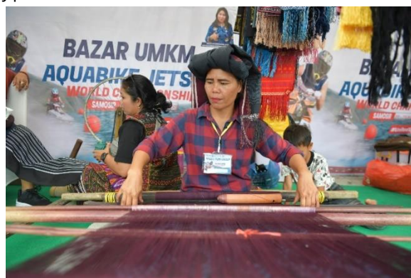
Figure 3. Making typical Batak ulos cloth at the UMKM booth around the venue