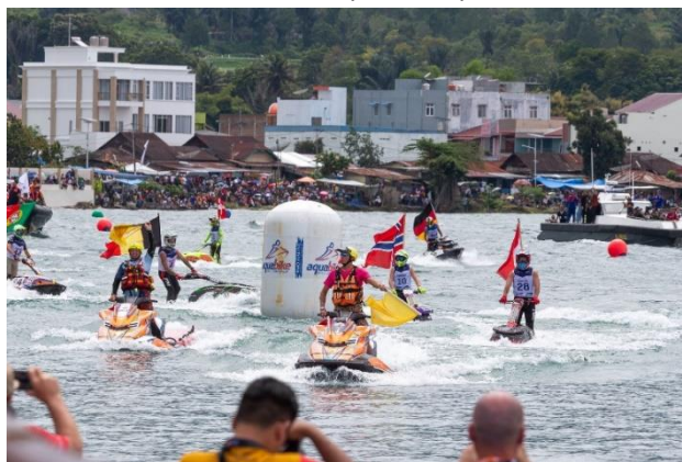
Figure 2. Aquabike Jetski World Championship 2023 Lake Toba Balige series