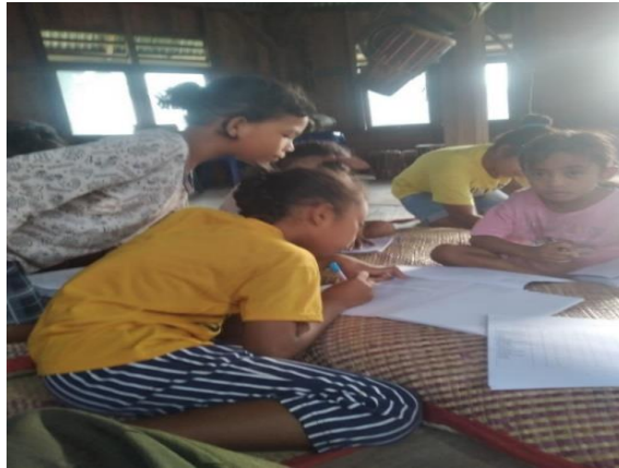
Gambar 4. 1 Pelatihan bahasa Inggris

socialization activities about culture held by the Labuan Bajo Tourism Office at the Jayakarta Hotel and English language training" (interview June 13, 2024).