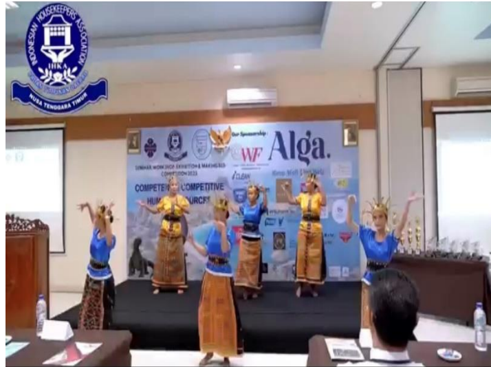
Figure 4. 8 Performing traditional dances at IHKA events