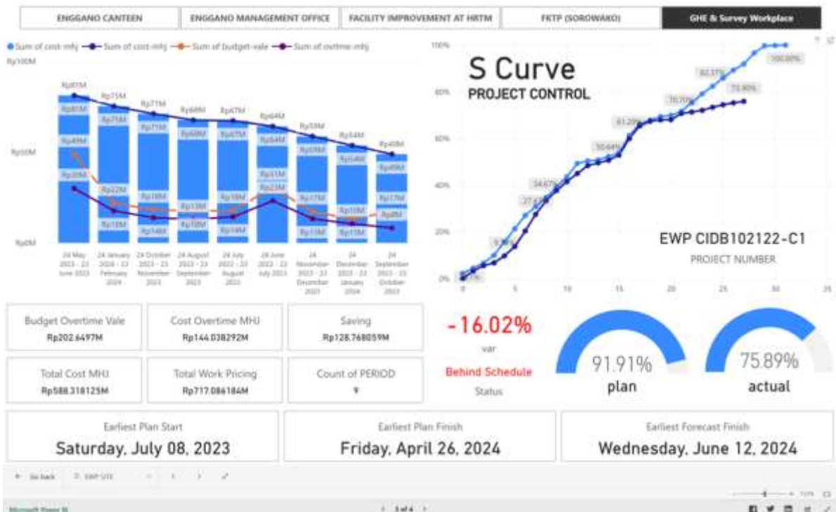
Picture 2 Dashboard Project Performance Results

The dashboard designed in Power BI displays important information such as project progress, workforce performance, safety, and cost management. This data visualization helps management monitor and evaluate project performance more efficiently. The implementation of Power BI enables real-time monitoring of key KPIs, including project costs, completion time, and workforce productivity.